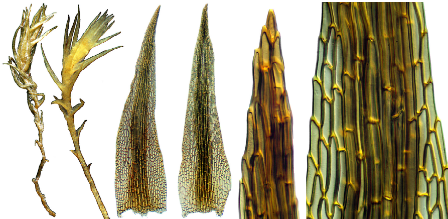
vegetative shoot (dry and wet), leaf outlines, and leaf apex and subapex

1 mm (2), 0.1 mm (2), 10 \mu m, 10 \mu m