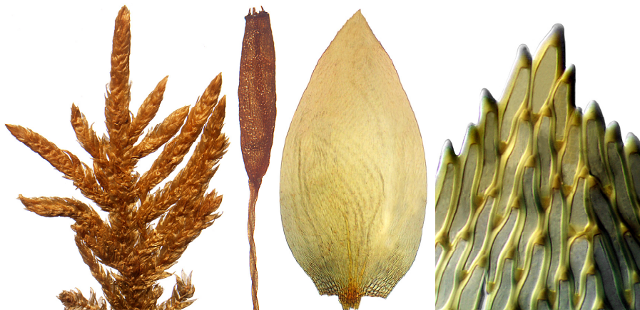
vegetative shoot (dry), capsule (dry), leaf outline, and leaf apex