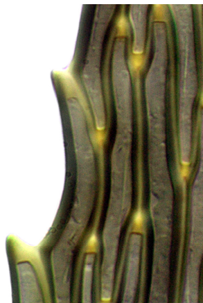
margin midleaf ■ 10 \mu m