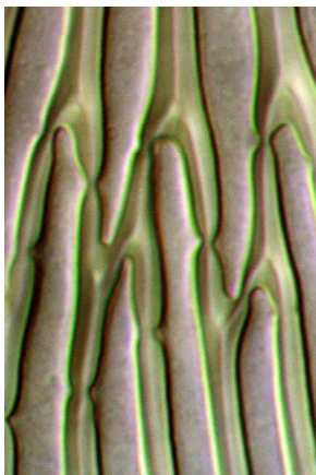
cells midleaf ■ 10 \mu m