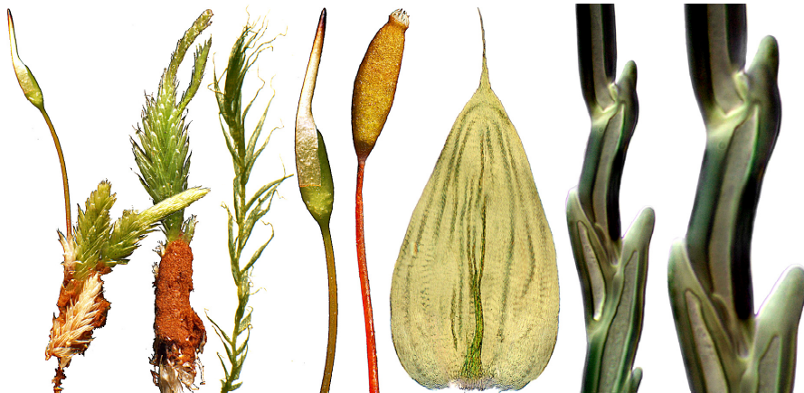
fertile and vegetative shoots, flagellate propagule, capsules, leaf outline, and hair-point ■ 1 mm, ■ 1 mm, ■ 1 mm, ■ 1 mm (2), ■ 0.1 mm, ■ 5 \mu m, ■ 5 \mu m