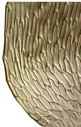
leaf basal angle ■ 50 \mu m