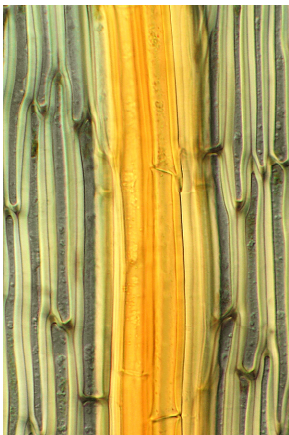
costa midleaf 10 \mu m