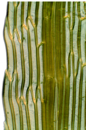
margin midleaf 10 \mu m