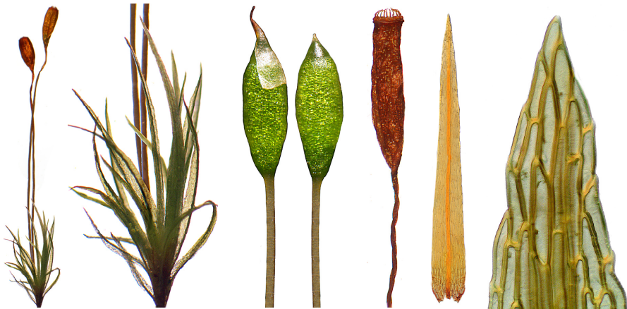
fertile shoot, young capsules, mature capsule, leaf outline, leaf apex, and leaf base 1 mm, 0.5 mm, 0.5 mm, 0.5 mm, 0.5 mm, 10 \mu m