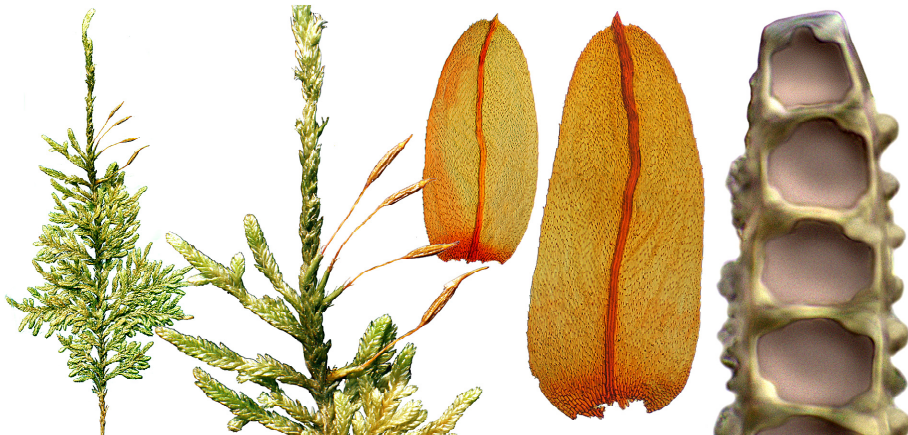
fertile habit, branch and stem leaf outlines, and brood body (portion) 10 mm, 5 mm, 1 mm, 10 \mu m