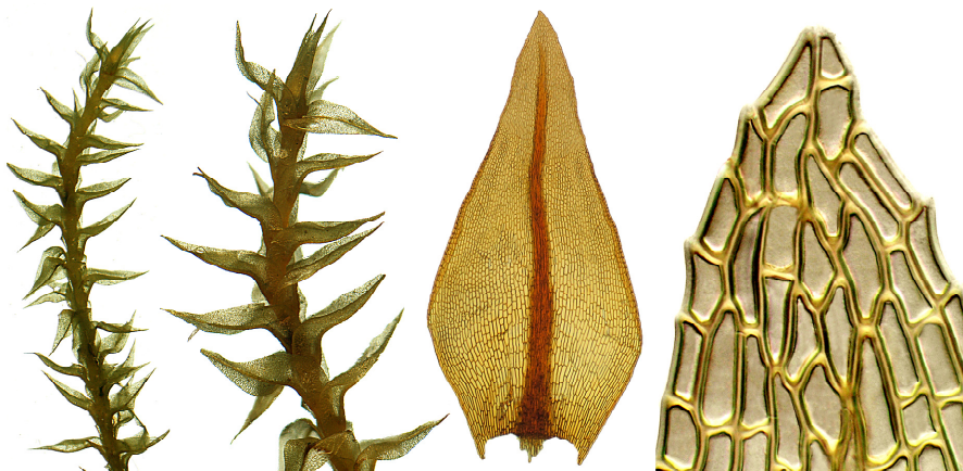
vegetative shoot, leaf outline, and leaf apex