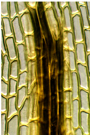
costa upper leaf