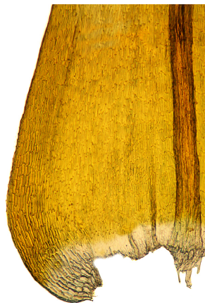
leaf basal angle ■ 0.1 mm