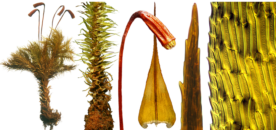
fertile shoot, stipe, mature capsule, leaf outline and apex, and margin midleaf ■ 5 mm, ■ 1 mm, ■ 1 mm, ■ 0.5 mm, ■ 5 \mu m, ■ 10 \mu m