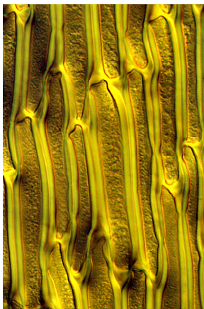
cells midleaf ■ 5 \mu m