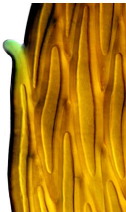
border lower leaf

10 mm, 5 mm, 1 mm, 1 mm, 0.5 mm, 10 \mu m