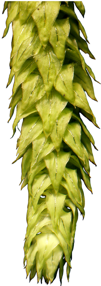
Papillaria flavolimбата vegetative pendent shoot tip 1 mm