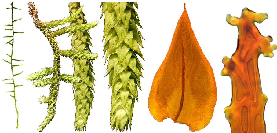
vegetative shoots, leaf outline, and papillose forked leaf apex

10 mm, 5 mm, 1 mm, 1 mm, 0.5 mm, 10 \mu m