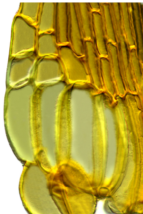
inflated alar cells 10 \mu\text{m}