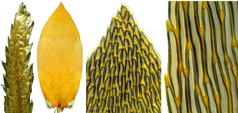
vegetative branch (dry), leaf outline, apex, and margin midleaf 1 mm, 0.1 mm, 50 \mu\text{m} , 10 \mu\text{m}