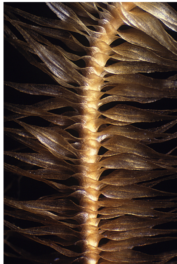
vegetative shoot (dry) 1 mm