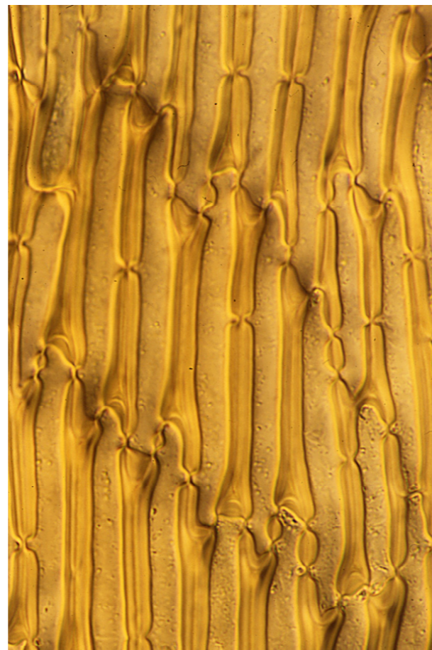
porose lamina cells 10 \mu m