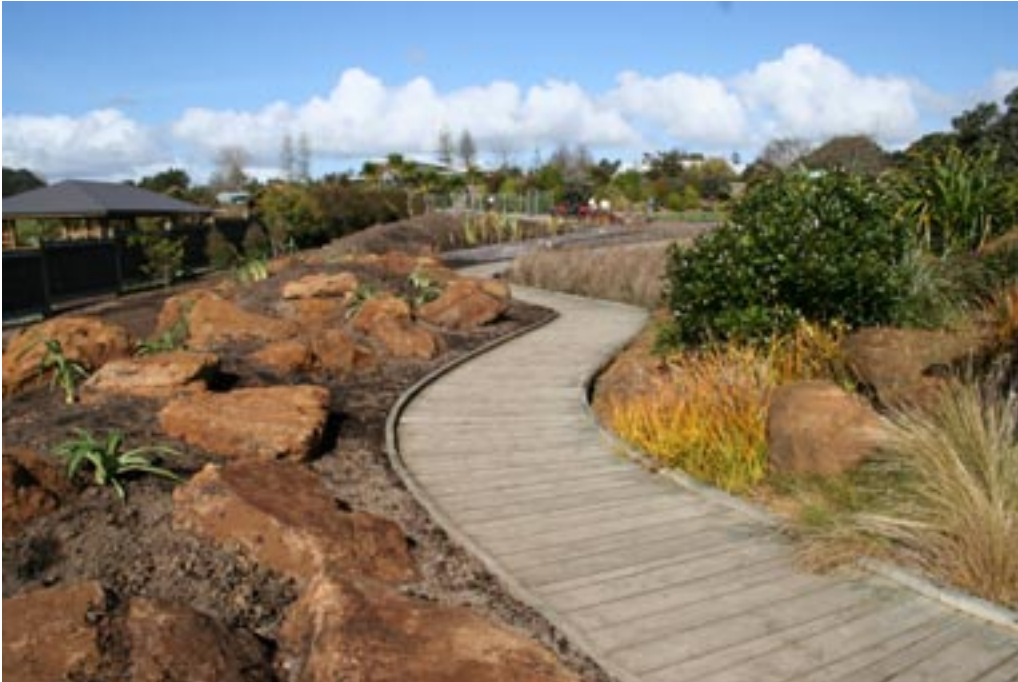
Coastal bluff with boardwalk

glasswort ( Sarcocornia quinqueflora ), coastal rush ( Juncus maritimus ), oioi ( Apodasmia similis ), Leptinella tenella , L. dioica subsp. dioica , Samolus repens , Selliera radicans , Suaeda novae-zelandiae . Threatened species will include NZ spinach ( Tetragonia tetragonioides ), Mimulus repens and Puccinellia stricta