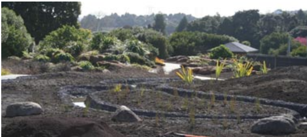
Saline wetland

A replicated sequence of vegetation zones within this saline wetland viz. below mid-tide, above mid-tide, reached only by spring tides, reached only by storm tides is planned. The last three are usually referred to as lower-, middle-, and upper-marsh respectively. Key species will be mangrove ( Avicennia marina ),