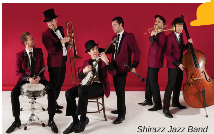
Shirazz Jazz Band