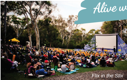
Flix in the Stix