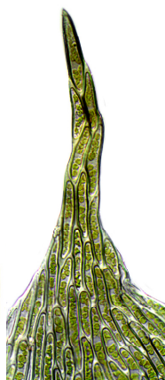
vegetative habit, cleared shoot, leaf outlines, and leaf apex 1 mm, 1 mm, 0.25 mm (2), 10 \mu m