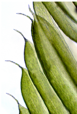
mucronate leaf tips 0.25 mm